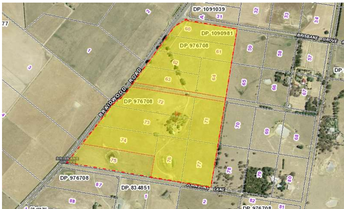
Figure 1: The subject land No. 2 Brisbane Grove Road, Brisbane Grove.